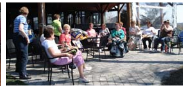
2007 Quilt Get-Away Weekend