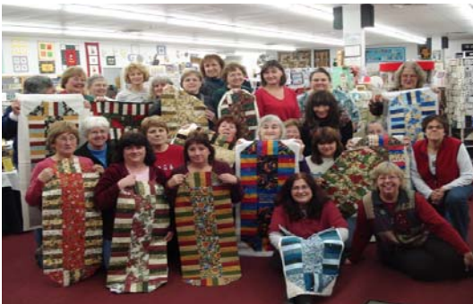
Handmade Holiday Retreat '09