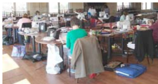
2009 Quilt Get-Away Weekend