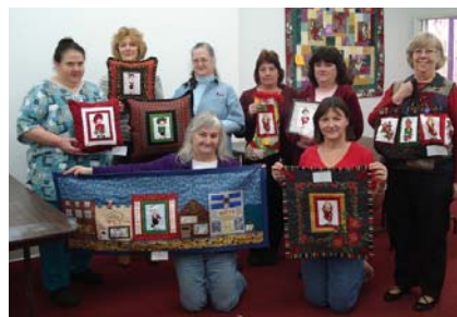
Quilt Challenges from Holiday Retreat '09