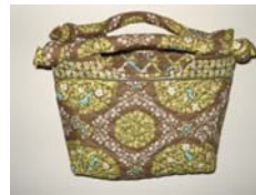
Oct. BAG LADY