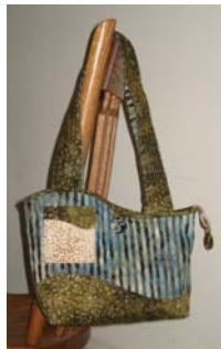
Sept. BAG LADY

The BAG LADY SERIES is a monthly class where we will be making various purses, totes and bags - some fancy, some functional but all fun. Learn new techniques in each class.