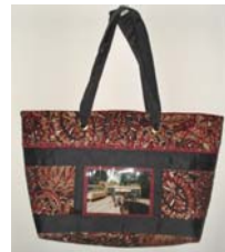
Nov. BAG LADY

In the MASTER QUILTER SERIES we will focus on a different topic each month. Come watch the demo and start a quick project using the technique. Scheduled topics include: September - "Making Your Own Piping for Bindings and Embellishments", October - "Making Continuous Bias Binding", November - "Continuous Prairie Points and Individual Prairie Points."